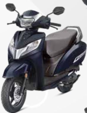
Pearl Siren Blue