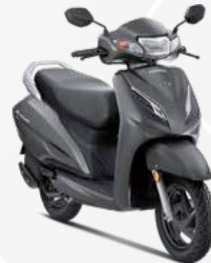
Mat Axis Gray Metallic