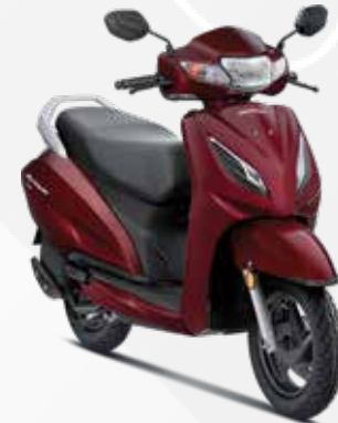
Rebel Red Metallic