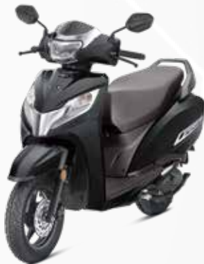
Pearl Igneous Black