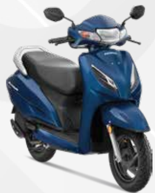
Decent Blue Metallic