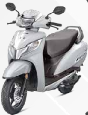
Pearl Precious White